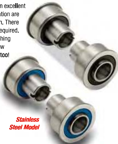
Stainless Steel Model

This bearing is perfect when excellent rolling ease and quiet operation are required for your application. There is no maintenance grease required. The integrated spanner bushing makes installation easy. Now available in stainless steel, too! To order, see page 112.