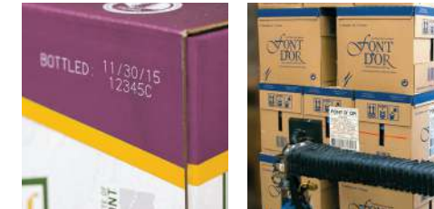
Coated Glossy Corrugate